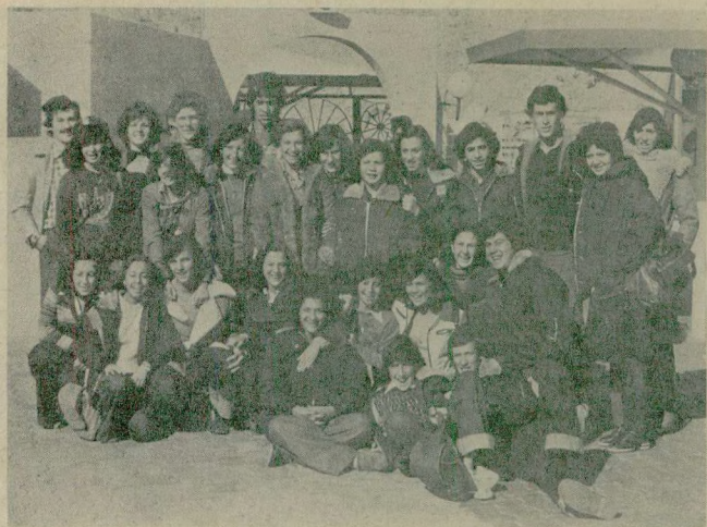
2. Maccabi youngsters from Uruguay on 21 day tour of Israel - at the Oceanarium at Eilat.