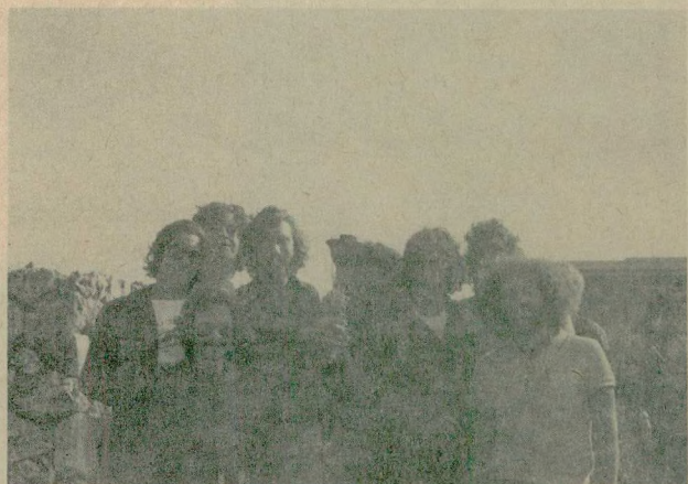
4. & 5. Maccabi youngsters from C.D.I. Mexico taking part in the Chanukah Torch Relay - outside the President of Israel's residence in Jerusalem.